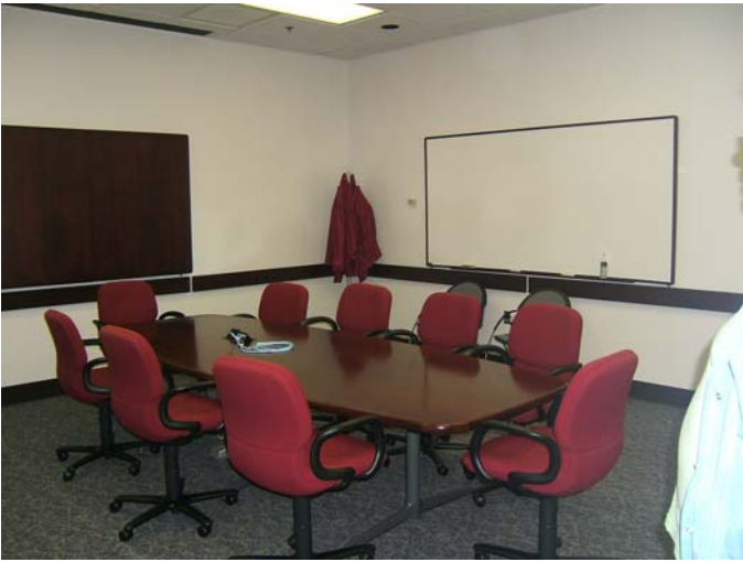
Shared Board Room